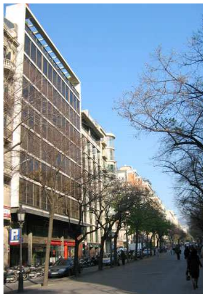
FraLucca offices in Barcelona